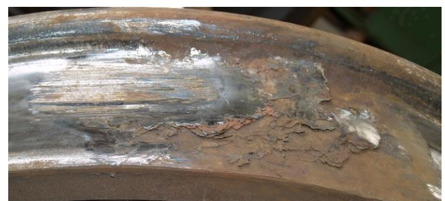
Fig. 3. Wheel flat [16]

According to [15], a wheel flat can be defined as a local abrasion occurring on the wheel rolling surface, causing the loss of its original contour (Fig. 3). Wheel flat occurs as a result of sliding between the wheel and the rail, which is most often generated by wheel locking during braking due to poor technical conditions of the brake or improperly selected braking force. Other factors that contribute to wheel-rail slip are third-party bodies between the wheel and the rail (e.g. leaves, snow) or contamination of the rail surface. Fig. 4 shows a wheel flat on the wheel running surface.