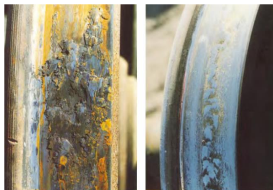
Fig. 4. Scaled wheels [17]

tion – respectively a wheel flat is formed on the wheel, which releases material to the rail, and a scaled wheel is formed on the wheel, to which the material adheres.