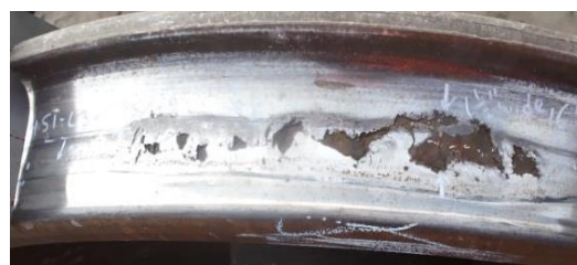
Fig. 5. Shelling wear [18]

Wheel wear by shelling is manifested by the loss of a piece of material of the wheel tread [3]. Two basic types of this form of wear can be distinguished, which differ in the formation mechanism – shelling caused by fatigue of the rolling surface material and shelling generated by a slip between the wheel and the rail [14]. This type of wear is illustrated in Fig. 5.