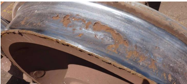
Fig. 6. Spalling wear [19]

It is pointed out that the spalling phenomenon, especially in the case of tram vehicle wheels, does not lead to abrupt wear of wheel rolling surfaces due to its surface character, because as a result of the frequent wheelset reprofiling, it is possible to inhibit this type