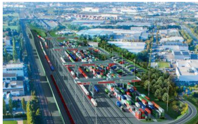
Fig. 1. Visualization of the Deutsche Bahn terminal Regensburg-Burgwainting

An example of one of the priority projects in the area of terminals in Germany is the planned (approved in 2022 by BMDV) expansion of the Deutsche Bahn terminal in Regensburg (Regensburg-Burgwainting) [12].