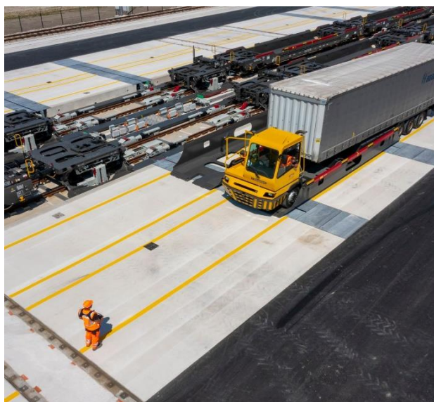
Fig. 2. Cargo Beamer System [16]

The last two decades have brought further improvements to both vertical and horizontal loading systems for semi-trailers on railway platforms. This is because more and more of them are not suitable for lifting using cranes (according to some sources, even 80 percent [21]).