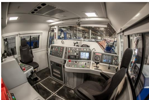
Fig. 4. Driver's cab of modernized SM42 locomotive

A new solution that the locomotives have been equipped with is a microprocessor control system that improves the traction properties of the vehicles and also allows to reduce fuel consumption. The moderni-