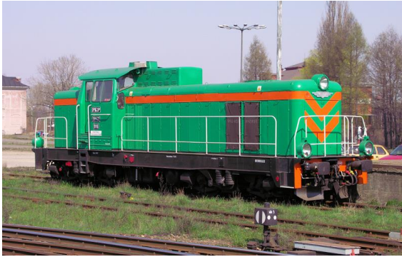
Fig. 1. SM42 locomotive [12]

The locomotive parameters are presented in Table 1.