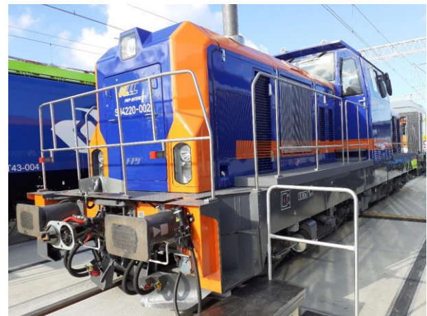
Fig. 2. SM42 locomotive after modernization (SU4220)

In December 2022, H. Cegielski FPS completed the contract for the repair of P5 with the modernization of 13 SM42 diesel locomotives to the SU4220 series (Fig. 2).