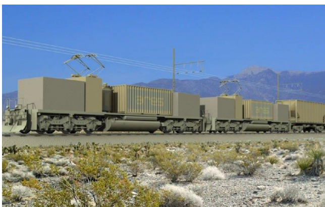
Fig. 1. ARES energy storage shuttle train [5]

An interesting project that implements the concept of energy storage in rail vehicles is an initiative by ARES. The American company ARES has developed an innovative energy storage system using electric rail cars, heavy concrete blocks and regenerative braking technology (Fig. 1). The solution captures and stores energy by moving heavy blocks to the top of hills during periods of excess electricity, such as that generated by wind farms, or during off-peak periods. When energy is needed, the railcars are slowed down, and as they return downhill, kinetic energy is converted into electricity through regenerative braking. The system incorporates two technologies: a traction drive system, which is designed for gentler hills, and Ridge-line cable car drive technology, which can handle much steeper slopes.